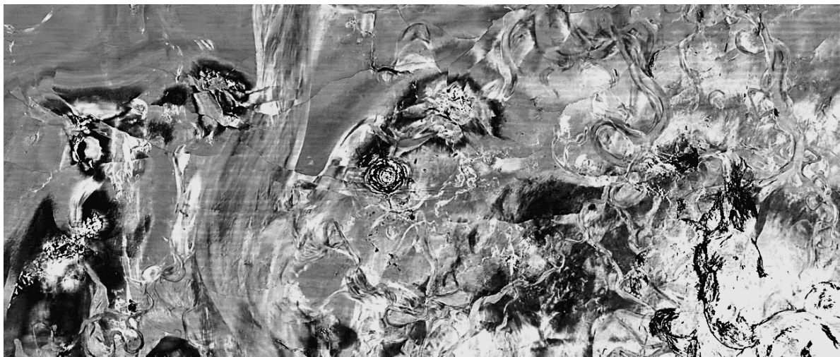
Figure 3. Fluvial channel systems from the Rajang Delta can be seen near seabed on the Sarawak MC3D PSTM data. Further processing workflows towards the final PSDM dataset is currently ongoing.

Phase 1 of the new Sarawak MC3D project will help assess exploration risk and form the basis of renewed play evaluations in the region. The PSTM data, shows detailed channel features (Fig. 3) in the post-MMU section and the pre-MMU section (Cycles I-IV) can be clearly identified and accurately mapped. The pre-MMU syn-rifts formed during the extensional phase of the basin history and the new data helps identify sedimentary packages and de-risk new plays. Furthermore, deeper imaging has allowed the identification of deep-seated faults that will allow for better understanding of basin development history and hydrocarbon migration. Future acquisition phases will result in a larger footprint of broadband seismic data, enabling a better regional scale understanding of the Sarawak Basin, as well as supporting near-field infrastructure led exploration activities.